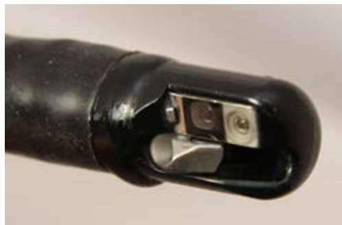
Figure 1: Close-up view of an ERCP endoscope tip.

Device: All ERCP endoscopes (side-viewing duodenoscopes)